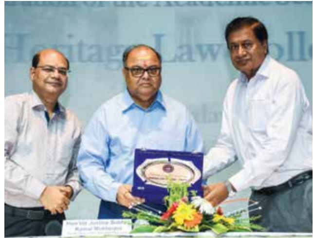
Hon'ble Justice Subhro Kamal Mukherjee, Former Chief Justice, Karnataka High Court