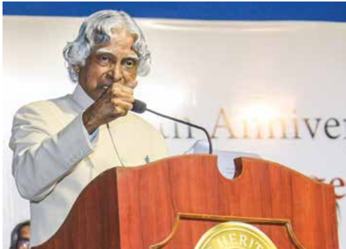
Bharat Ratna Late Dr. A.P.J Abdul Kalam