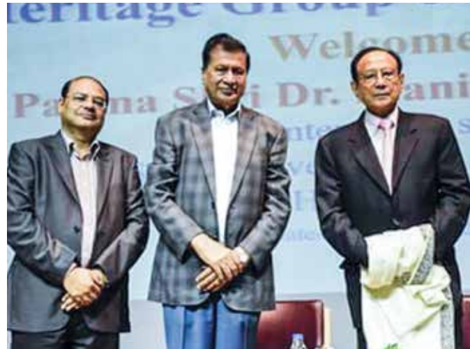
Padma Shri Dr. Mani Lal Bhaumick