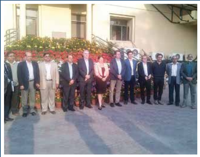
Various Universities from UK visited Heritage Law College under UK Law Mission organised by British Council of India....