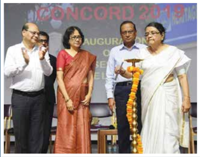
Honourable Justice Ruma Pal, former Judge, Supreme Court of India (in the extreme right)